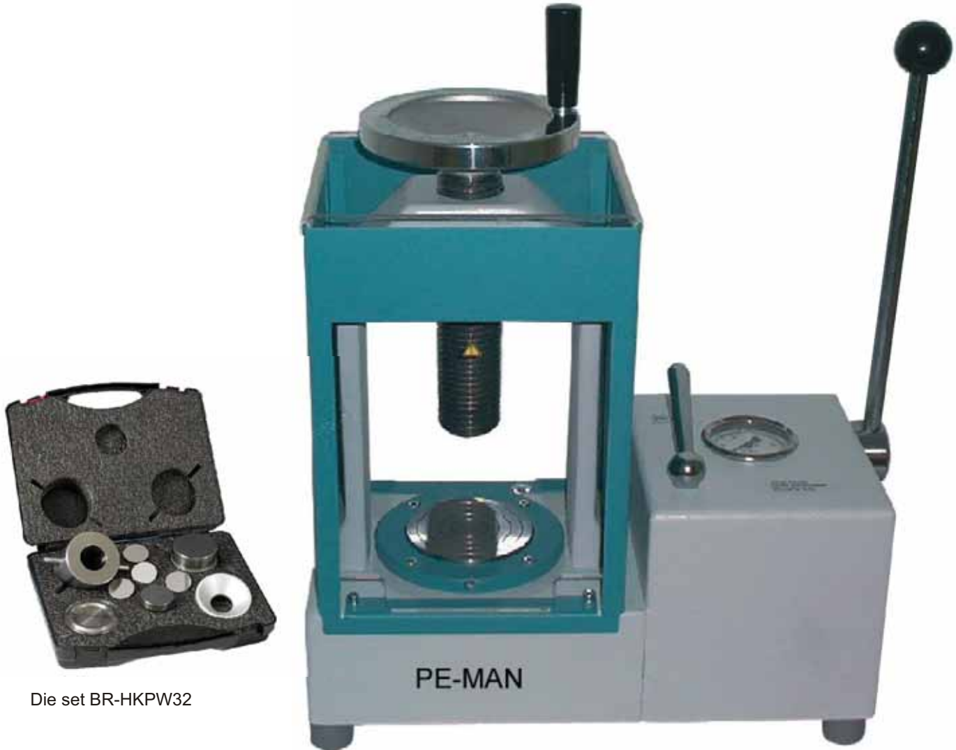
Die set BR-HKPW32

manual hydraulic press for sample preparation