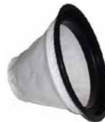
Exhauster motor protection