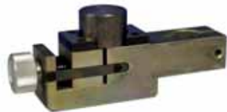
Standard vice with medium size jaws