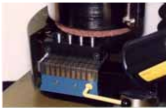
HK150 with magnetic plate and special holder for wire samples

Manual pendulum grinder with steel cabinet and integrated spark trap and dust exhauster