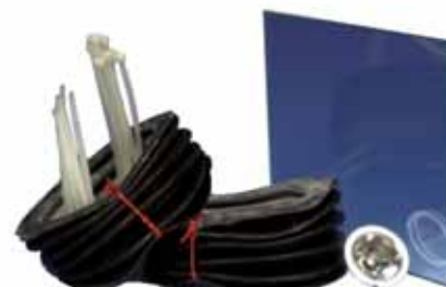
Spare parts kit