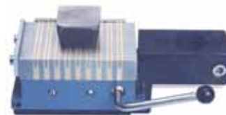
Magnetic plate with quick exchange arm