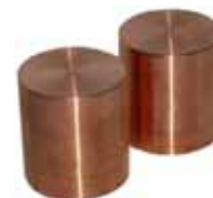
Copper cooling blocks