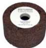
Cup wheel, open corundum stone