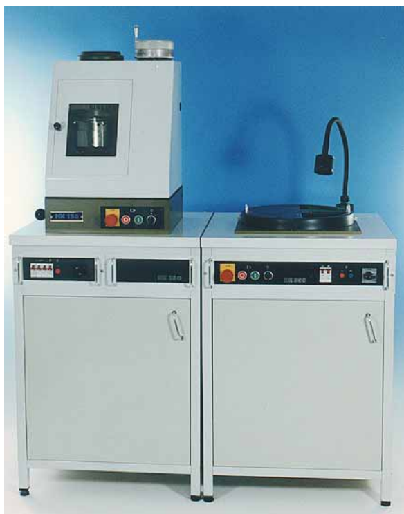
Pendulum grinder HK150 in combination with disc grinder HK350

Magnetic vice with handle and quick exchange arm Special vices - bigger vice for max. diam. 58 mm Hardened vice jaws: 3 mm, 9 mm (regular) and 20 mm Copper cooling blocks Corundum / silicon carbide cup wheels 150 x 80 x 32 mm Filter bags / exhauster motor protection filter Spare parts kit : 2 bellows, safety glass, halogen lamp