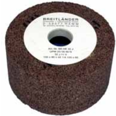
Cup wheel, open corundum stone