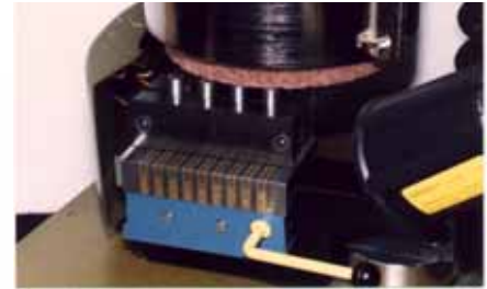
HK150 with magnetic plate and special holder for wire samples