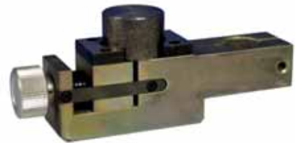
Standard vice with medium size jaws