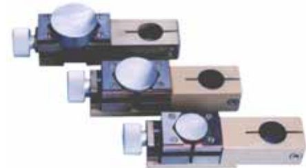
Vices for different sample diameters

Magnetic vice with handle and quick exchange arm Special vices - bigger vice for max. diam. 58 mm Hardened vice jaws: 3 mm, 9 mm (regular) and 20 mm Copper cooling blocks corundum / silicon carbide cup wheels 150 x 80 x 32 mm Spare parts kit : 2 bellows, safety glass, halogen lamp