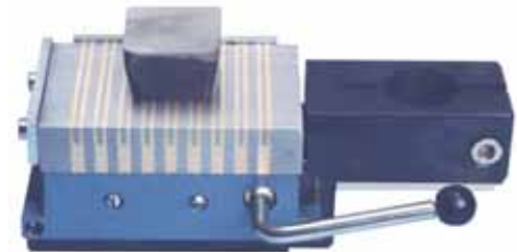
Magnetic plate with quick exchange arm

Vice for sample holding Grinding stone, tool for stone change Dressing bar for grinding stone Transport handles