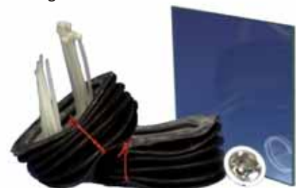
Spare parts kit